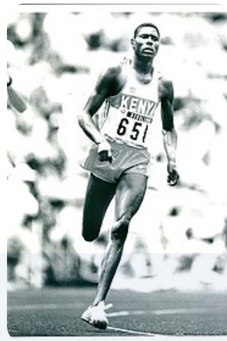
Paul Ereng Olympic gold medalist